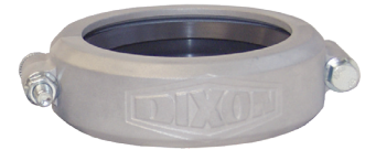
clamp with black nitrile rubber gasket

Note: Supplied clamp gasket must be installed prior to use, ships separately.