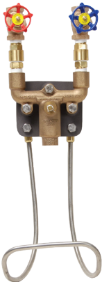
Station is not supplied with hose and nozzle