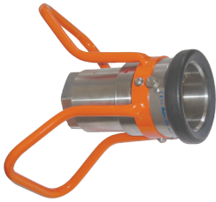
Coupler x Female NPT