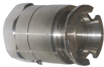
Adapter x Female NPT