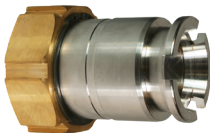
Adapter x Female ACME